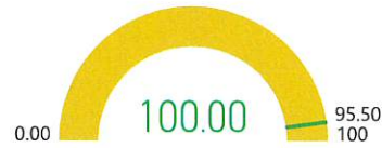
1S2: Extended Graduation Rate